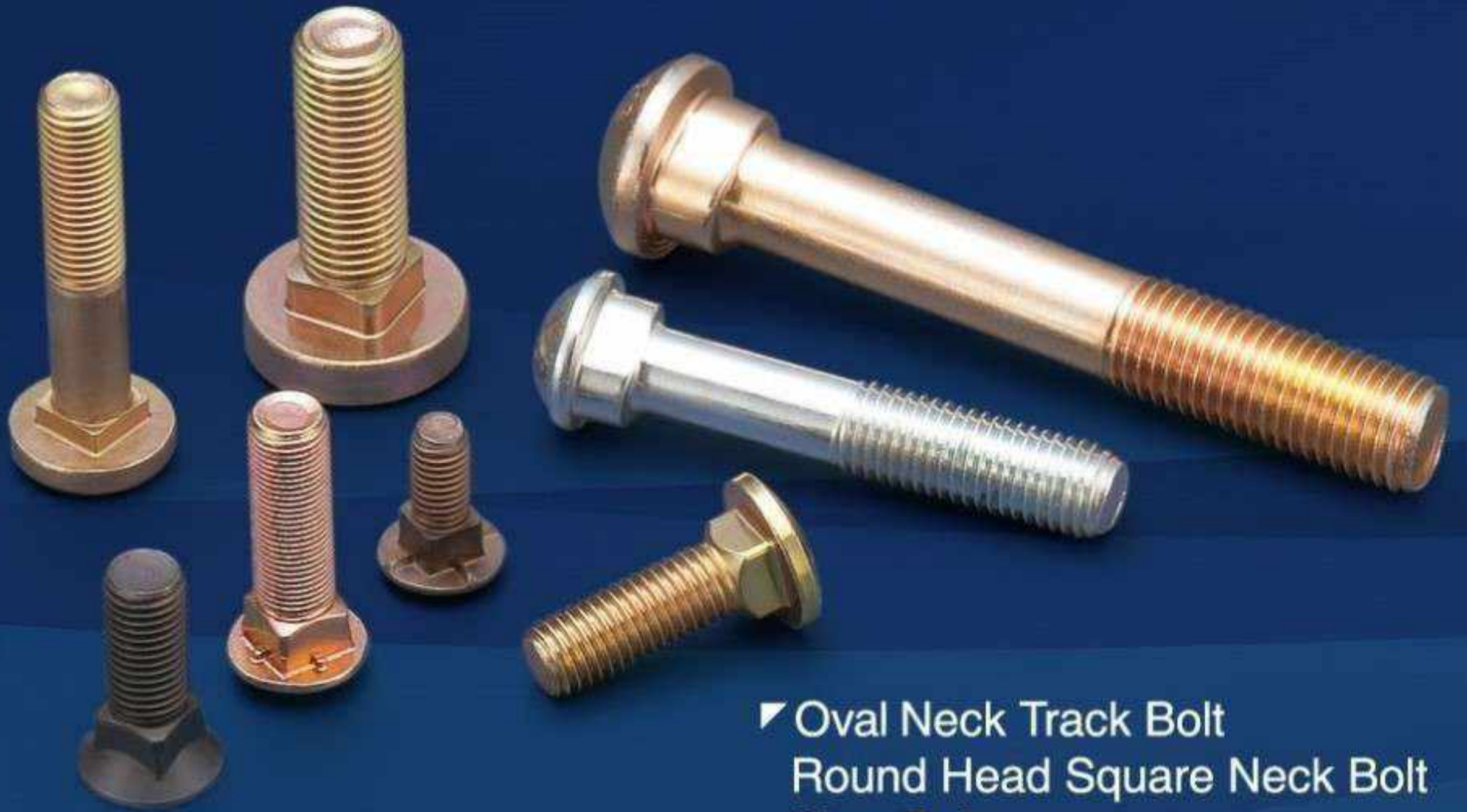
▶ Oval Neck Track Bolt Round Head Square Neck Bolt Plow Bolt