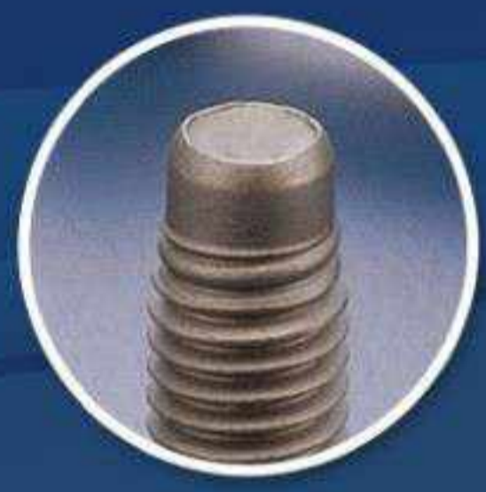
▶ Licensed MATHread