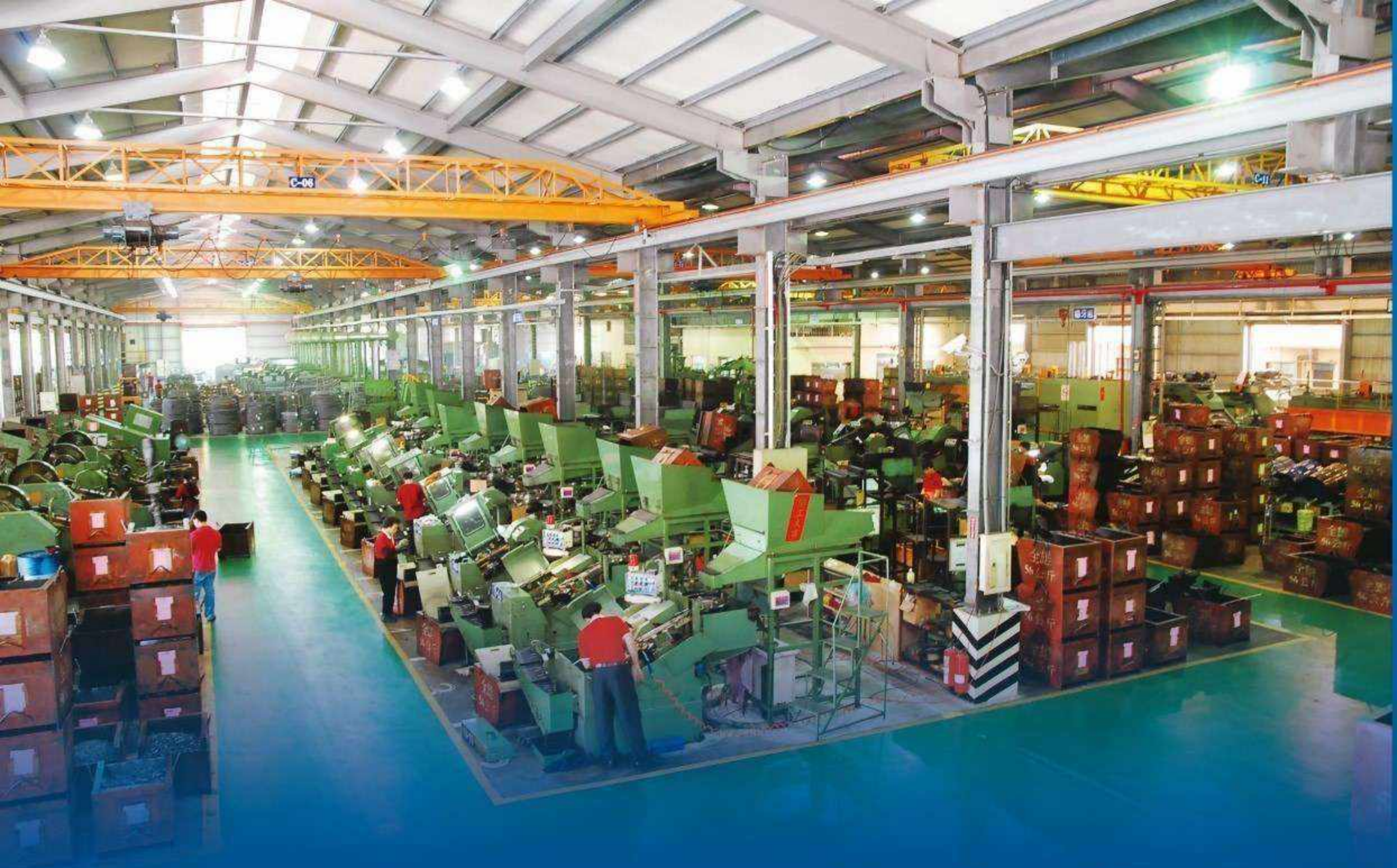
In-house Forming & Threading