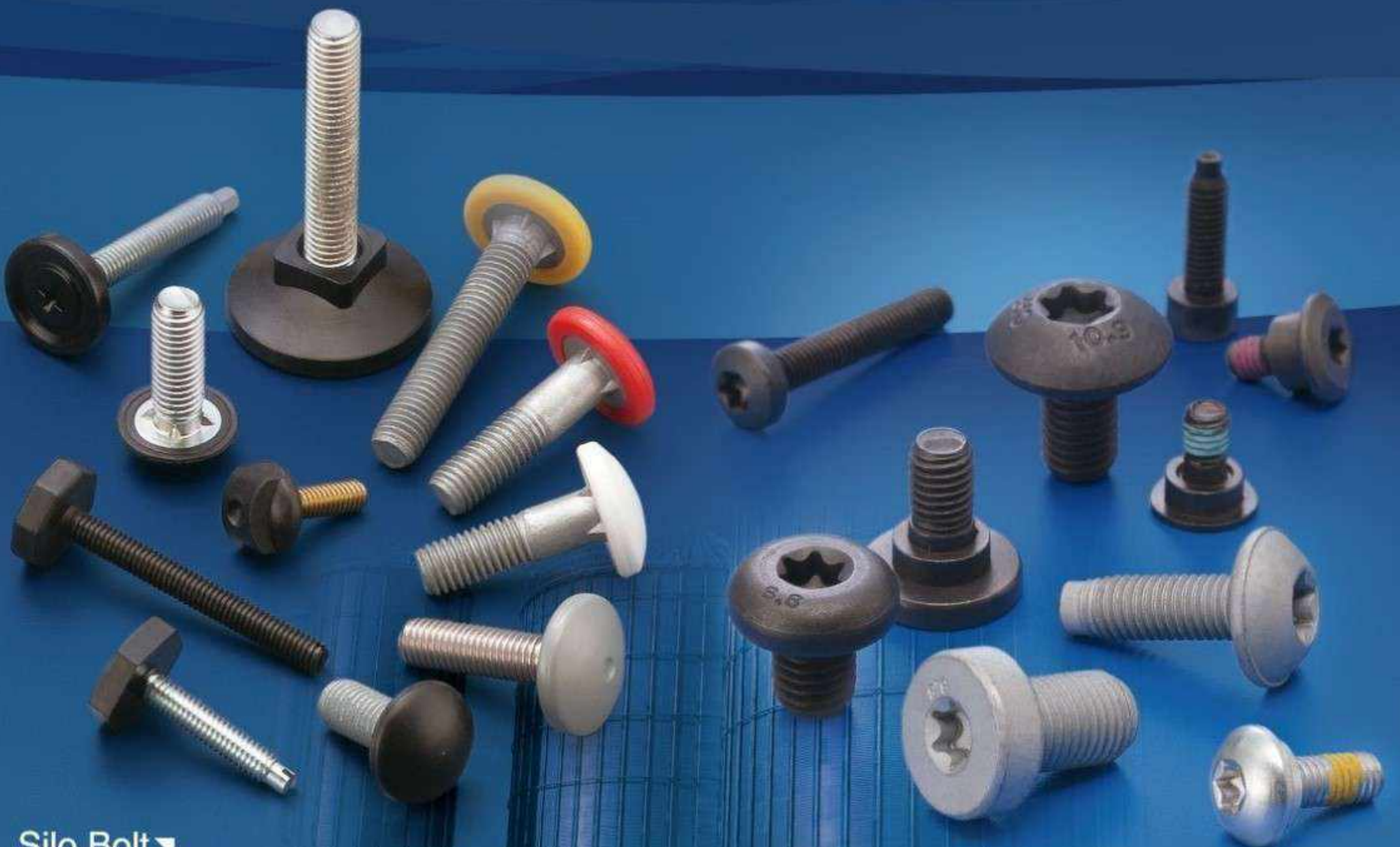
Silo Bolt ▼ Encapsulated Bolt