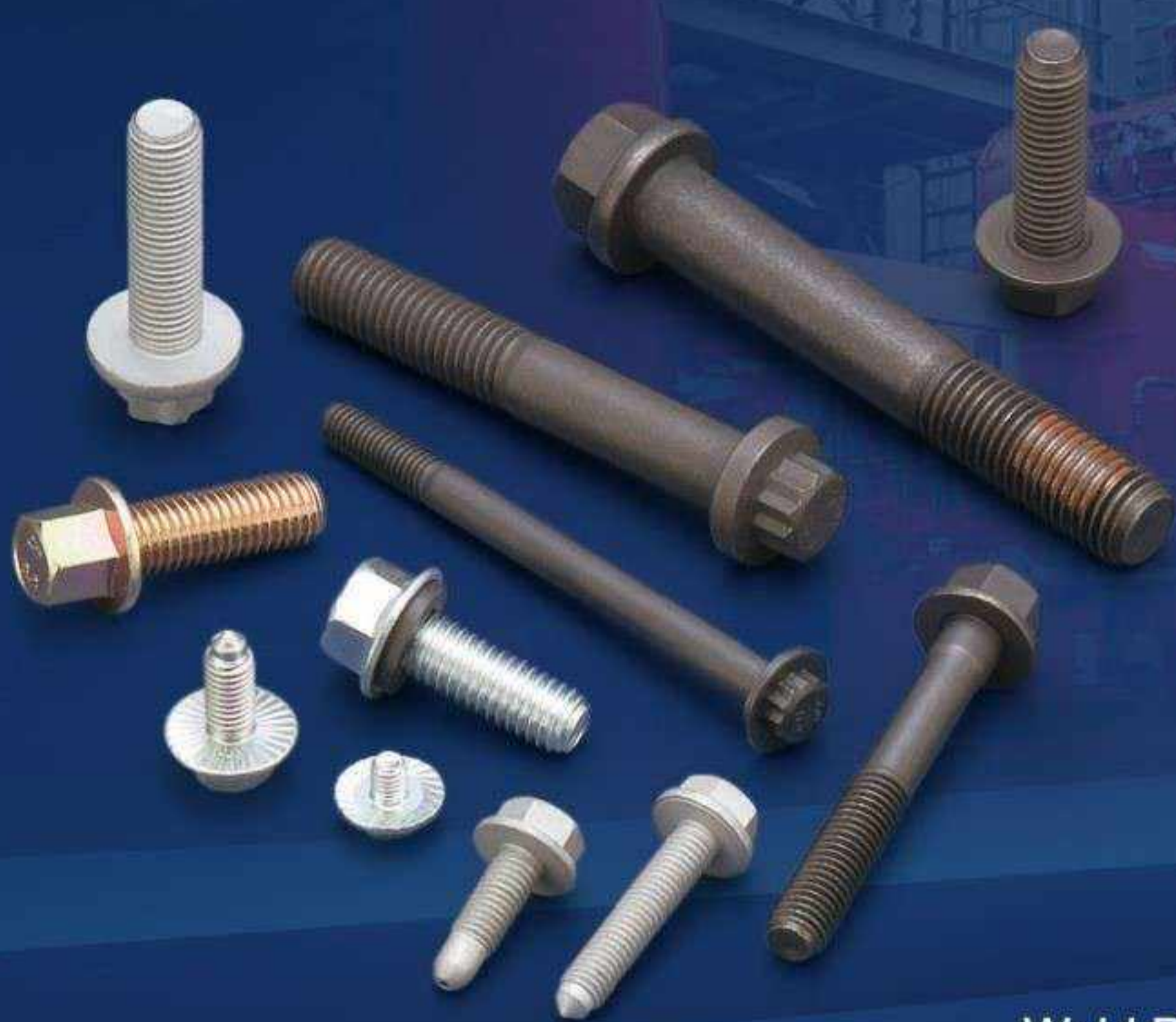
▶ Hex Flange Bolt 12-Point Flange Bolt